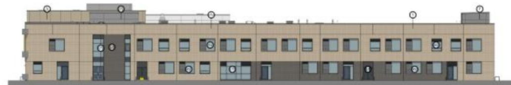
4 GA West Elevation Colour 1:200