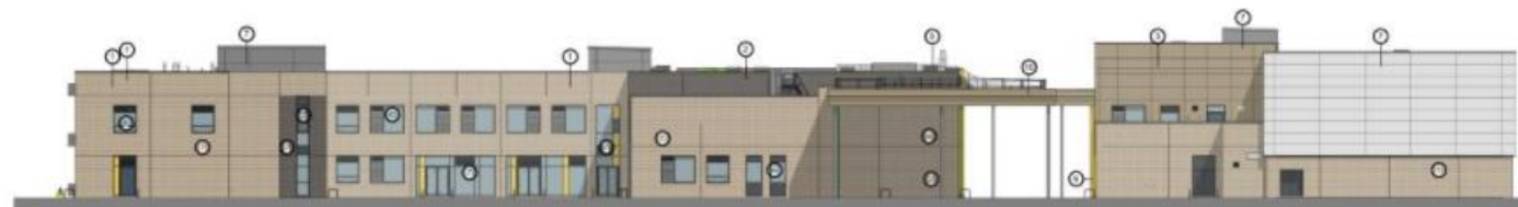
3 GA South Elevation Colour 1:200

How many bricks are being used on the job all together?