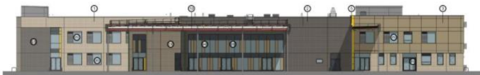
2 GA East Elevation Colour 1:200